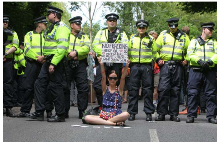
An issues-based investigation of the law is a key feature of the OCR specification.

To help teachers with their interpretation of subject content, each part of the specification has been linked to examples of learning activities. (Teachers are, of course, free to choose their own examples and learners can refer to any suitable examples in their exams.)