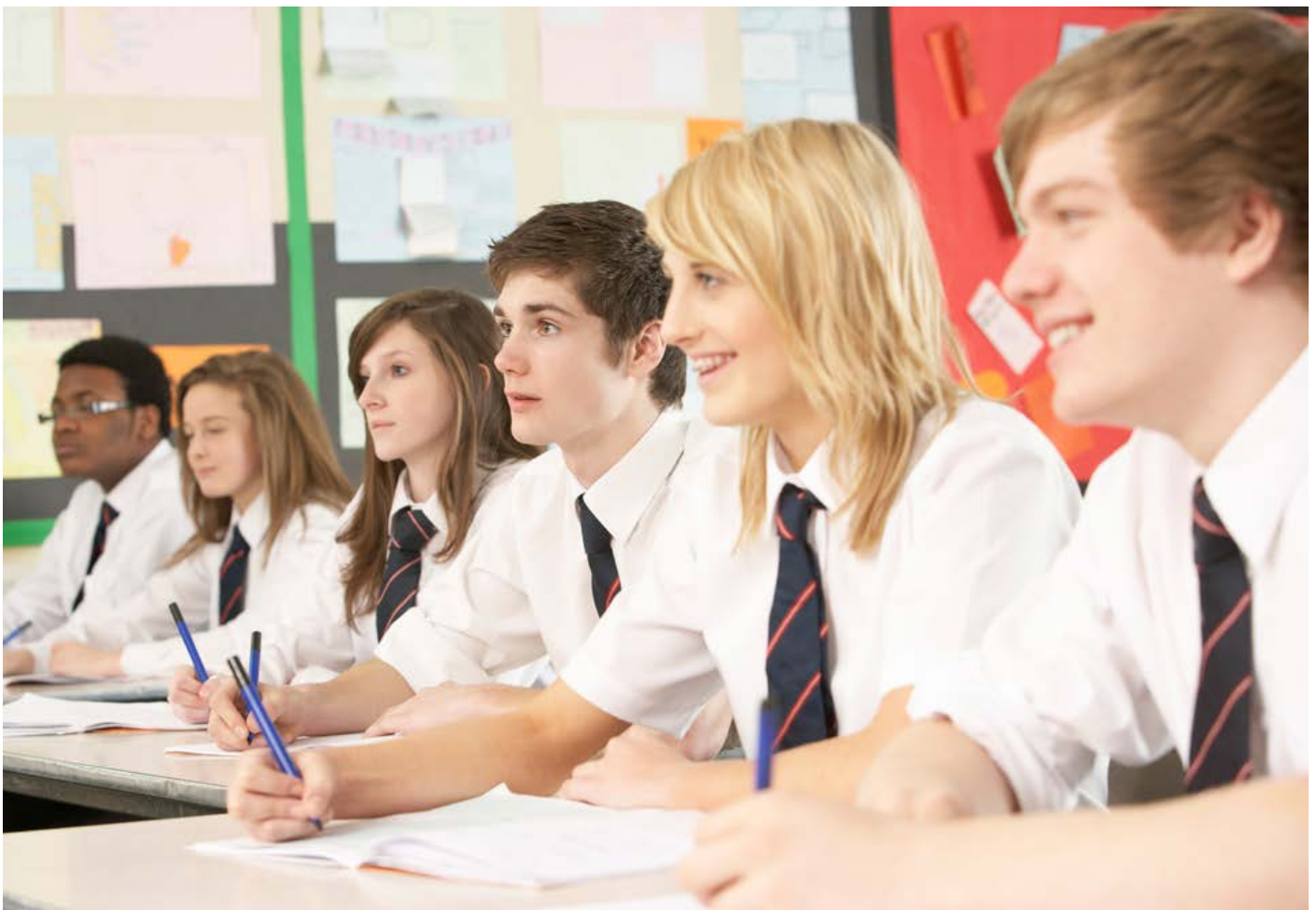
OCR's specification encourages stimulating learning