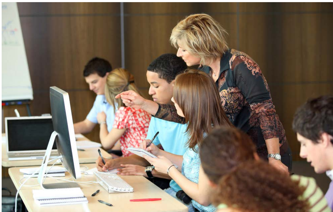
OCR's specification helps teachers to plan by highlighting key concepts and examples

We're also working in partnership with Hodder Education to produce new paper-based and electronic resources written specifically to support the OCR specification.