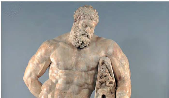
The Farnese Hercules (The Farnese Heracles) Created by Lisippo

Alcestis is carried off by Death, but help comes in the form of the hero Heracles, an old friend of Admetus (they had travelled together on the Argo ). Heracles, on his way to perform his eighth labour, is portrayed here as a buffoonish, larger-than-life boozier; he wrestles Death and forces him to give up Alcestis. He returns her to Admetus, and the play – unusually – has a happy ending.