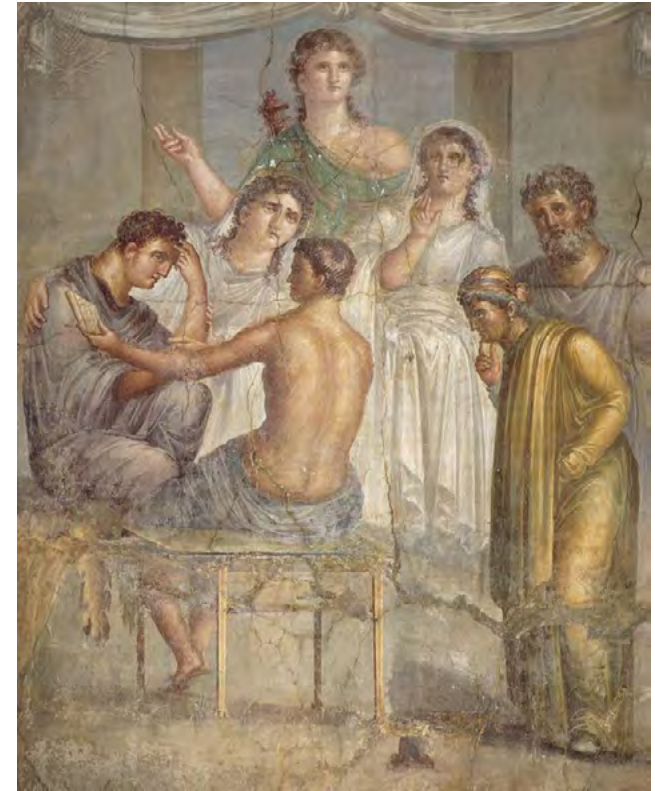
Fresco depicting Admetus and Alcestis, from Basilica in Herculaneum, Campania, Roman Civilization, 1st Century

Watch a production of Alcestis in Ancient Greek, with English subtitles. You may wish to locate and focus on the section that you are reading in Greek.