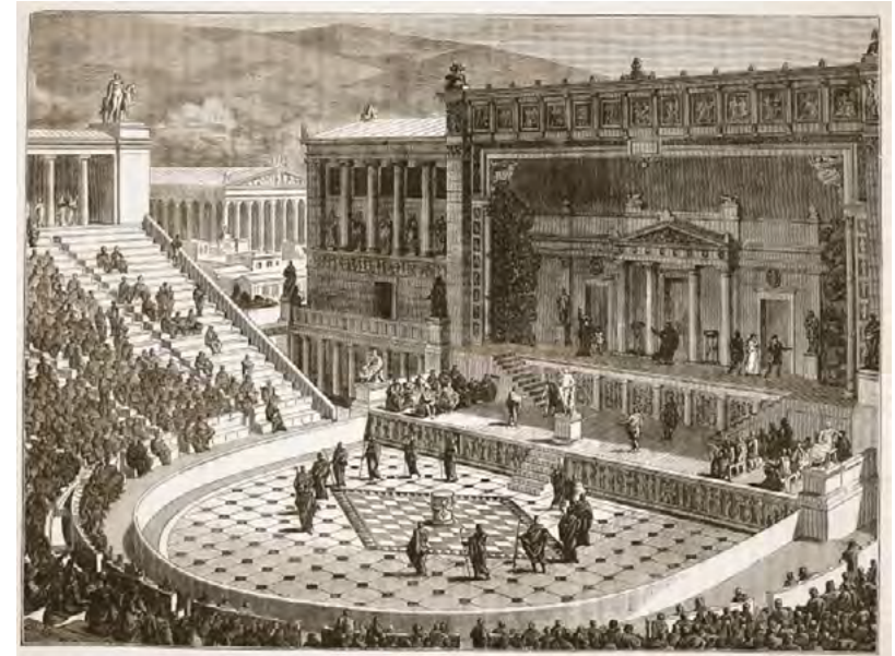
Theatrical performance in Ancient Greece

We know that the tetralogy containing Alcestis came second when it was first performed at the Dionysia of 438 BC. Euripides, in fact, only won first prize four or five times in his career, compared with Aeschylus's 13 and possibly over 20 for Sophocles. Unfortunately the vast majority of Greek drama has been lost; bear in mind that we can only read Classical books because they have been copied and distributed through the ages, which - especially before the invention of the printing press - was expensive and difficult. We may never have a chance to read the plays that the Athenian judges preferred!