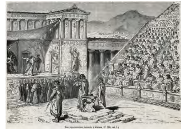
Theatrical performance in Ancient Greece

Satyr plays featured choruses of satyrs, the half-man, half-goat followers of Dionysos. Although, like tragedies, they were often about mythological themes, they were high-spirited, raucous and bawdy.