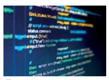
5 Supporting GCSE Computer Science