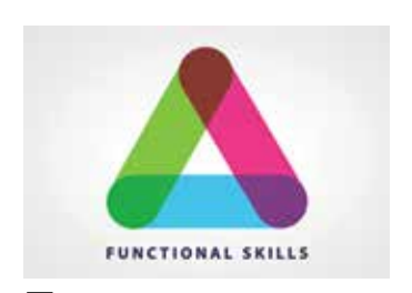
7 Getting real with Functional Skills