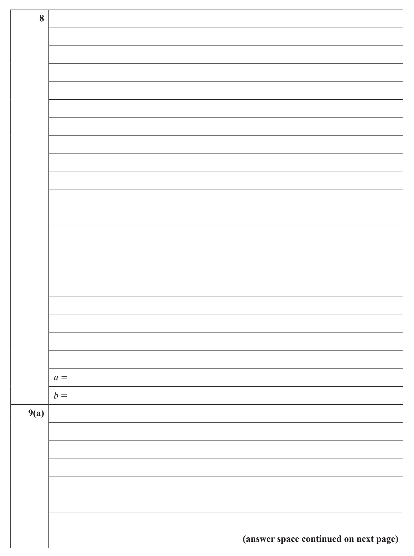
Section B (77 marks)