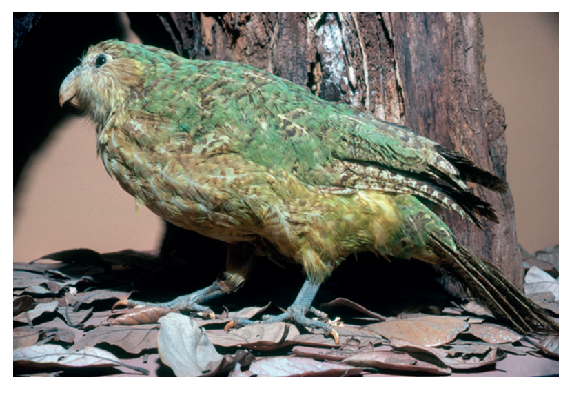
kakapo (Strigops habroptila)