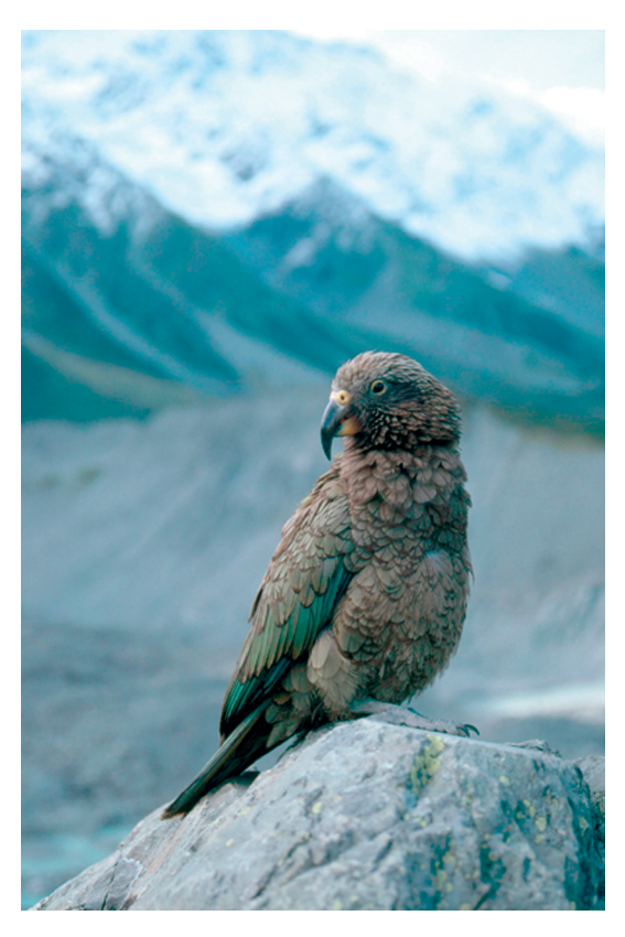
kea (Nestor notabilis)