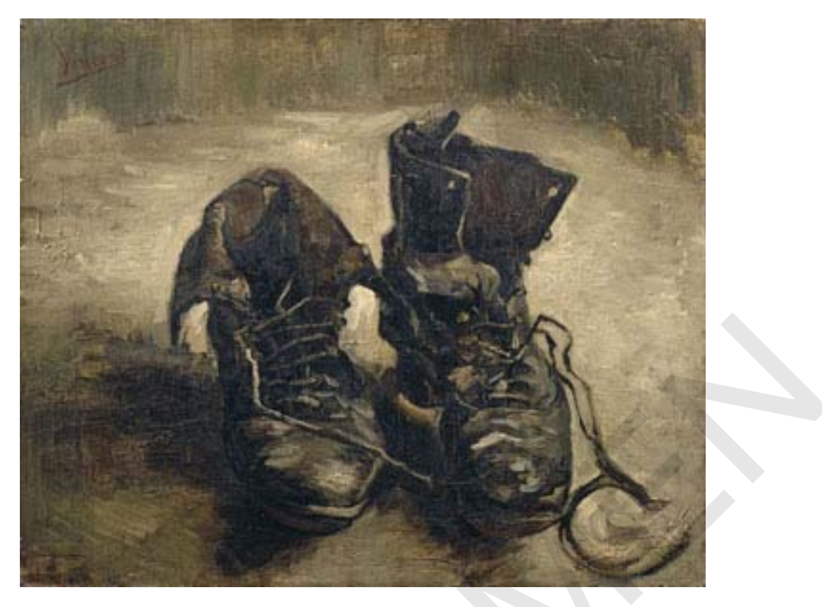
Image K - Van Gogh, A Pair of Shoes, Amsterdam, Van Gogh Museum (Vincent van Gogh Foundation)