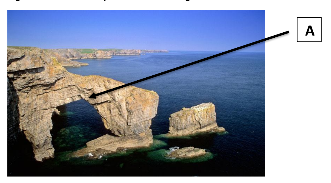
Fig. 1 - Coastal landscape in the United Kingdom