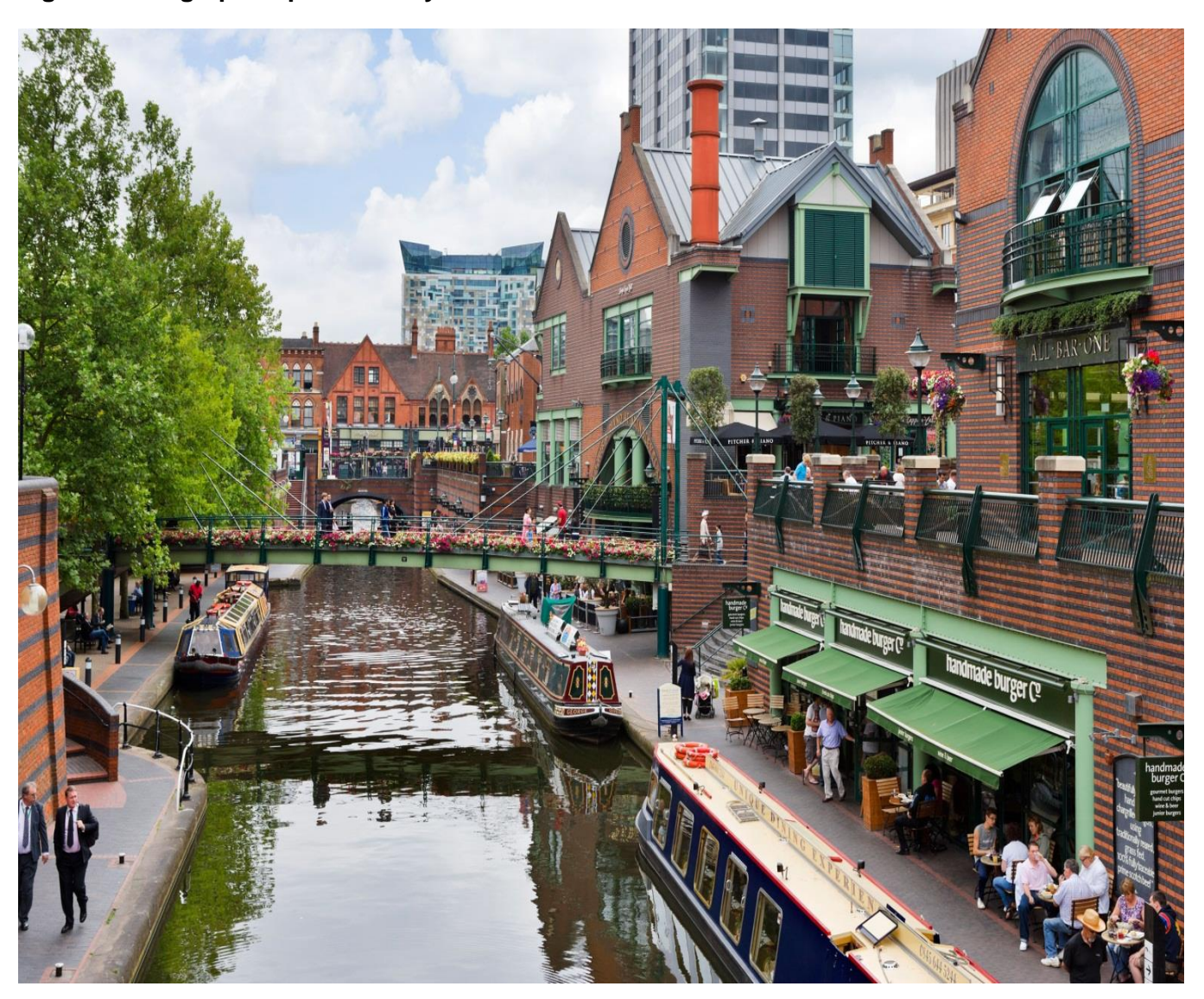
Fig. 1 - Photograph of part of a city in the UK in 2014