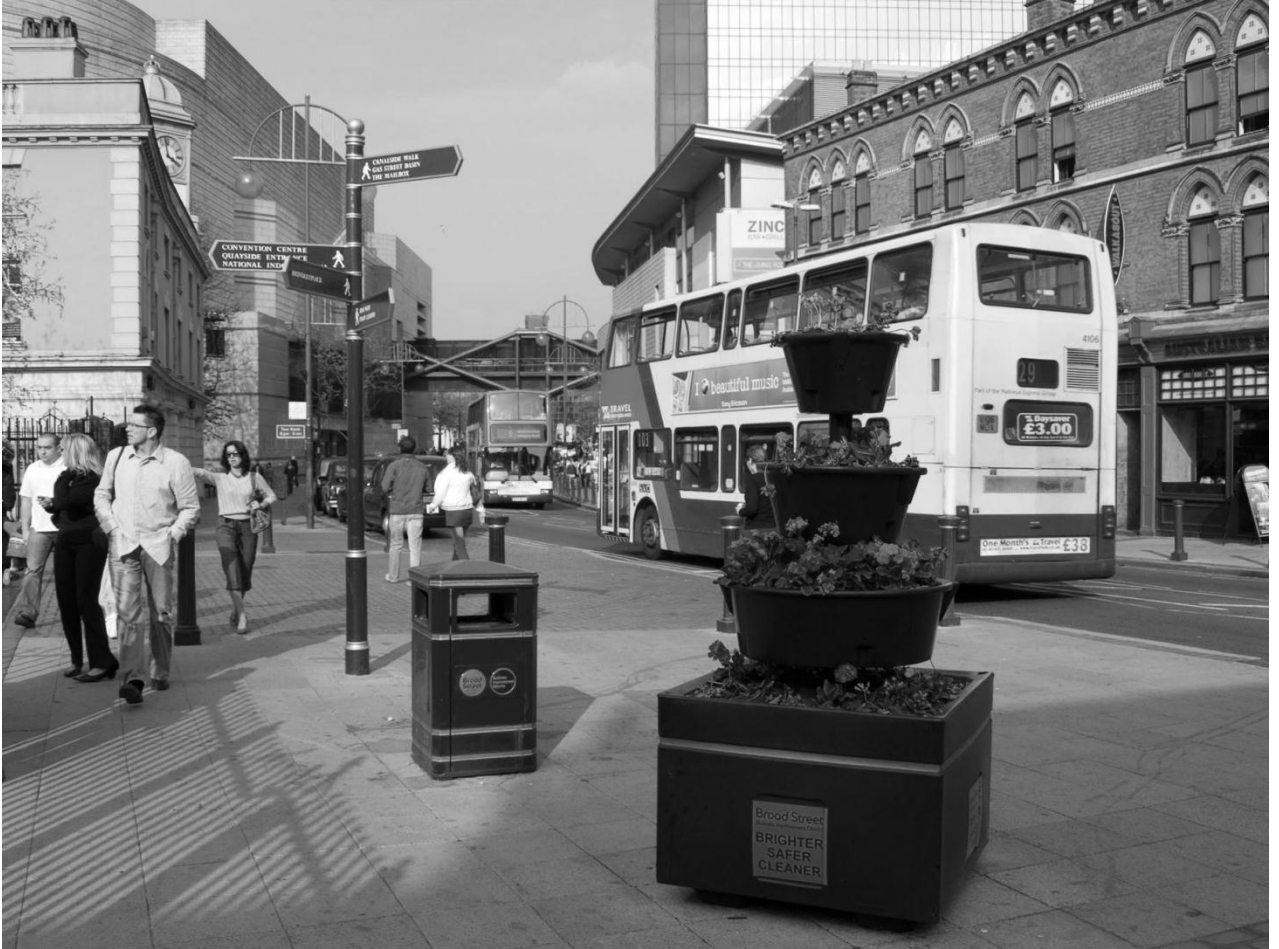
Source 1 Birmingham city centre