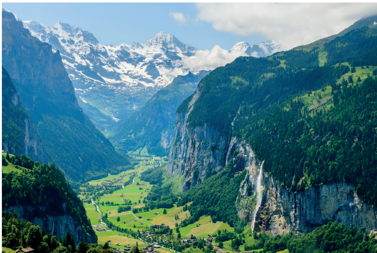
Fig. 5 – An area in which it is proposed to carry out an AS level geographical investigation