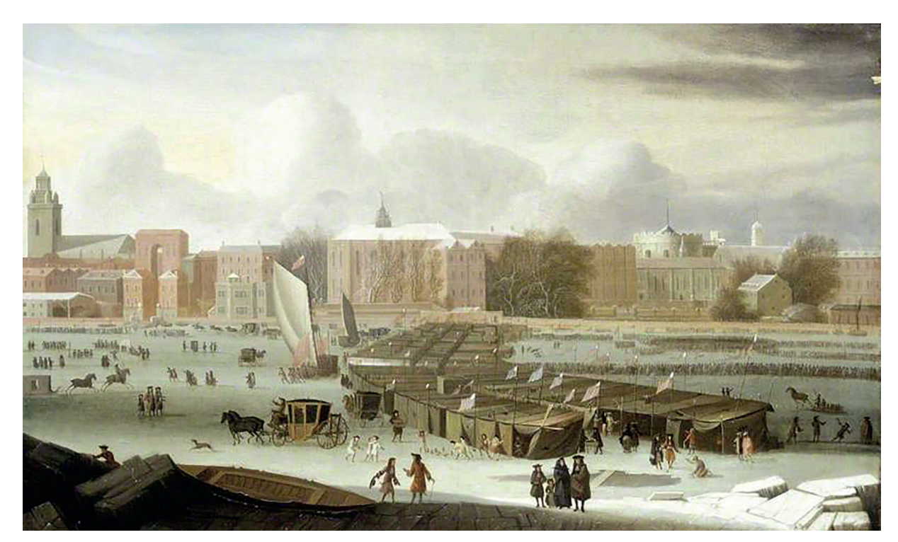
Fig. 4 – Painting of the River Thames in London in 1684