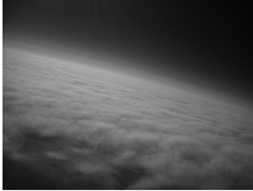
Fig. 2: photograph taken by the Meteotek Team using a digital camera in their high-altitude balloon

In February 2009, four Spanish schoolboys (of the Meteotek project) astounded scientists when they took pictures of the Earth's atmosphere using a simple digital camera that had been carried over 30 km into the sky by a helium-filled weather balloon. This type of low-budget experiment was undertaken by several other groups across the world shortly after. 35