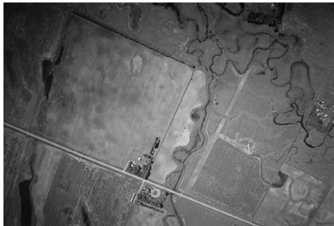
Fig. 3: digital camera image from a balloon at an altitude of just over 1000 m

The sample photograph in Fig. 2 shows cloud formations in the stratosphere and the curvature of the Earth is clearly visible. This picture was taken just a few weeks after NASA had announced details of a prototype balloon that could carry up to a tonne of equipment to great heights (over 35 km) and for sustained periods of time (11 days or more). There are long term plans for such balloons to replace satellites for certain functions as they are cheaper and more accessible. Mapping and monitoring the surface of the Earth would be a principal function and relatively easily carried out at a range of altitudes. The image in Fig. 3 was taken with a similar camera to that used for Fig. 2, with a screen resolution of 4352 × 3264 pixels. 40 45