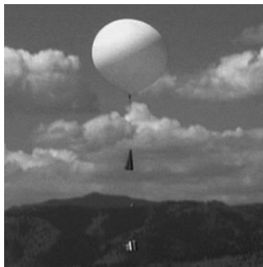
Fig. 1: a helium-filled weather balloon shortly after being released

Weather balloons are made of a very flexible rubber-based material and have a mass of about a kilogram before being inflated. They are usually filled with hydrogen, though sometimes helium is used. The roughly spherical balloons are typically about 2 m in diameter. Upthrust (see Box 1) causes them to rise and as they do so they expand; at altitudes of around 35 km, their diameters have increased to about 8 m. When they exceed this size, they burst and the small package of measuring instrumentation (called a 'radiosonde') falls to the Earth's surface. A small parachute automatically deploys to reduce the risk of harm when it lands and to preserve the instruments so that they can be re-used.