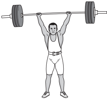
Fig. 6.1 shows a person carrying out an overhead press.

Classify this skill on the environmental influence continuum and the pacing continuum. Explain your answers.