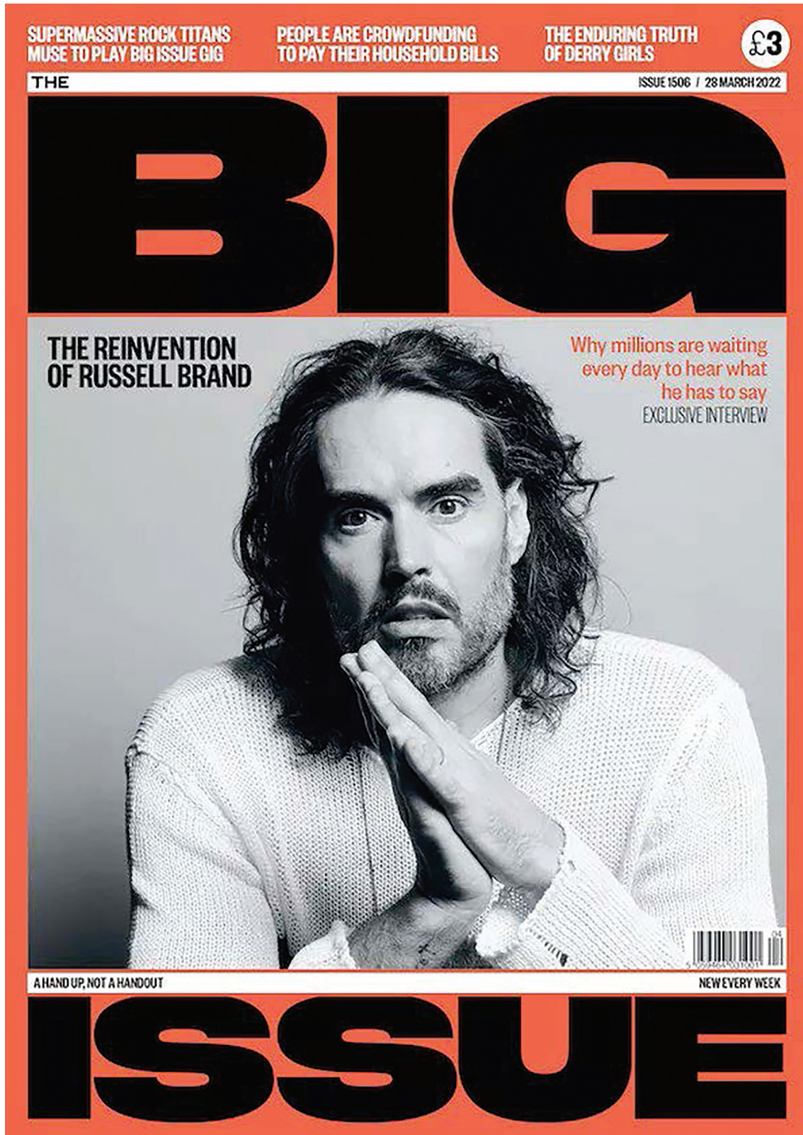
Source A is the front cover of The Big Issue (28 March 2022). It features Russell Brand, an English writer, broadcaster, YouTuber and comedian who has been active since the early 2000s. It also refers to rock band Muse and the popular Channel 4 sitcom Derry Girls .