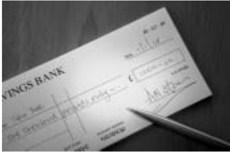
Numbers and words can be added to make it worth more