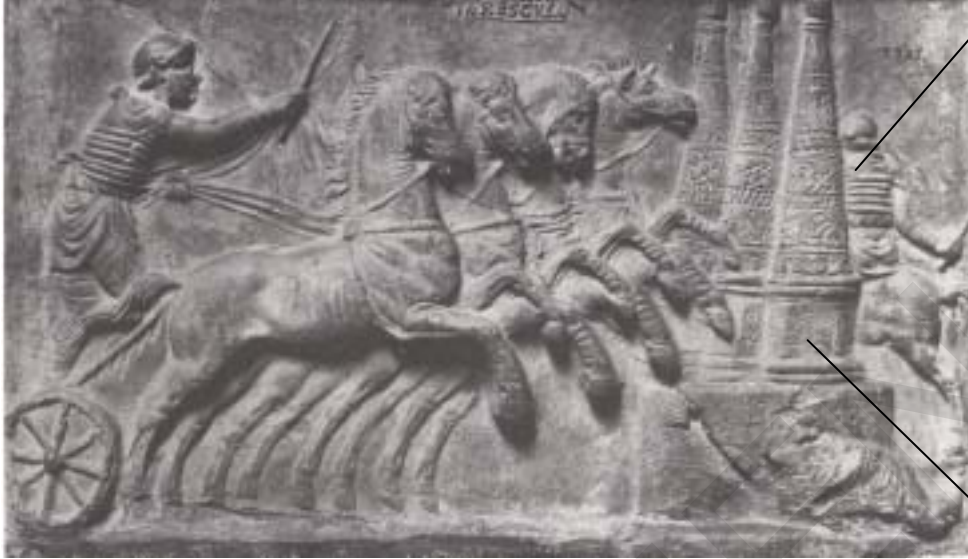
Relief of chariot racing (Terracotta relief, 1st century AD British Museum)